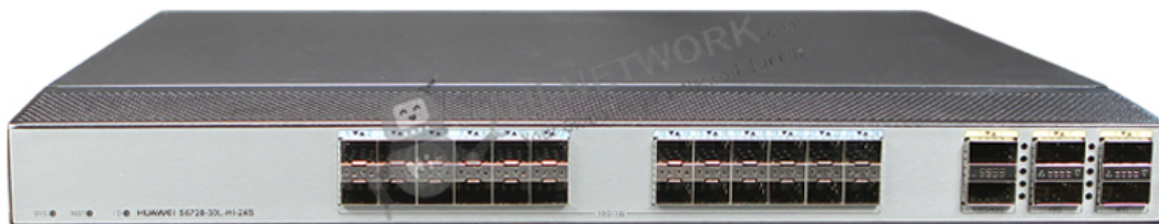
Figure 1 shows the appearance of S6720-30L-HI-24S.