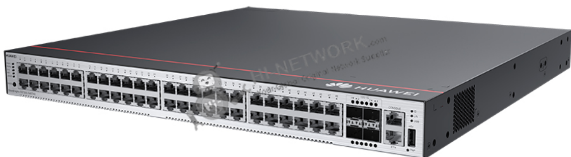
Figure 1 shows the appearance of S5735S-S48T4X-A.