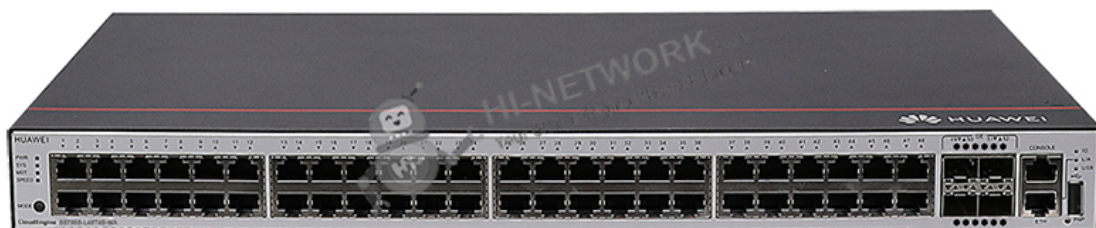
Figure 1 shows the appearance of S5735S-L48T4S-MA.