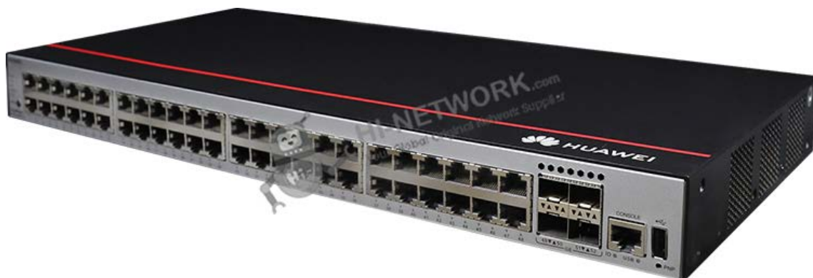
Figure 1 shows the appearance of S5735S-L48P4S-A1.