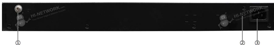
Figure 3 shows the back view of S5735S-L24P4S-A1.