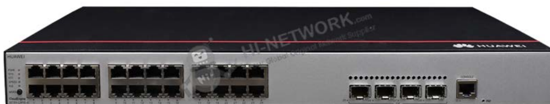
Figure 1 shows the appearance of S5735S-L24P4S-A1.