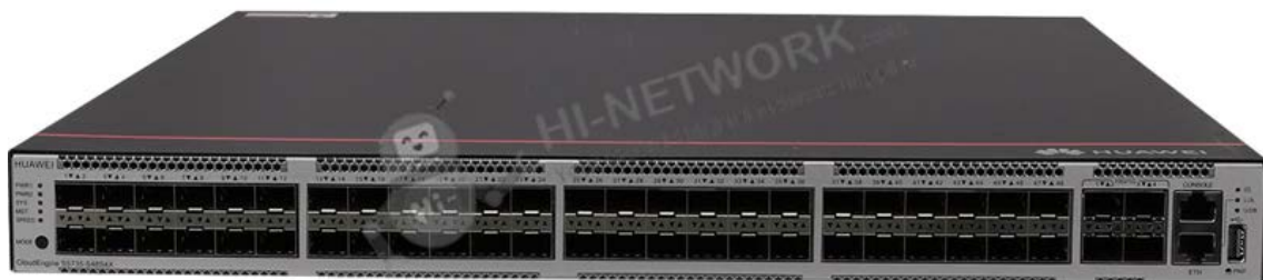
Figure 1 shows the appearance of S5735-S48S4X.