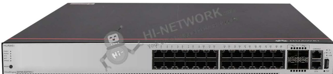
Figure 1 shows the appearance of S5735-S24T4X-I.