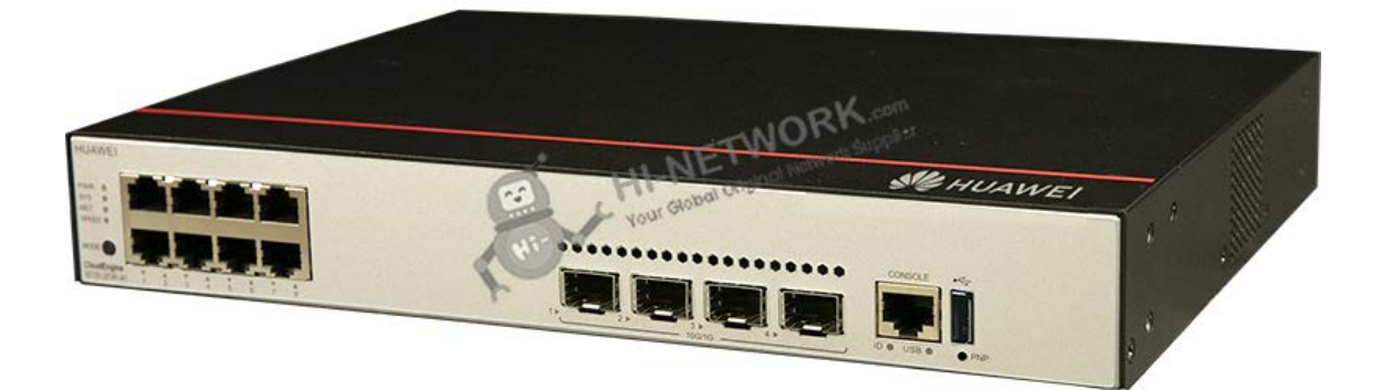
Figure 1 shows the appearance of S5735-L8T4X-IA1.