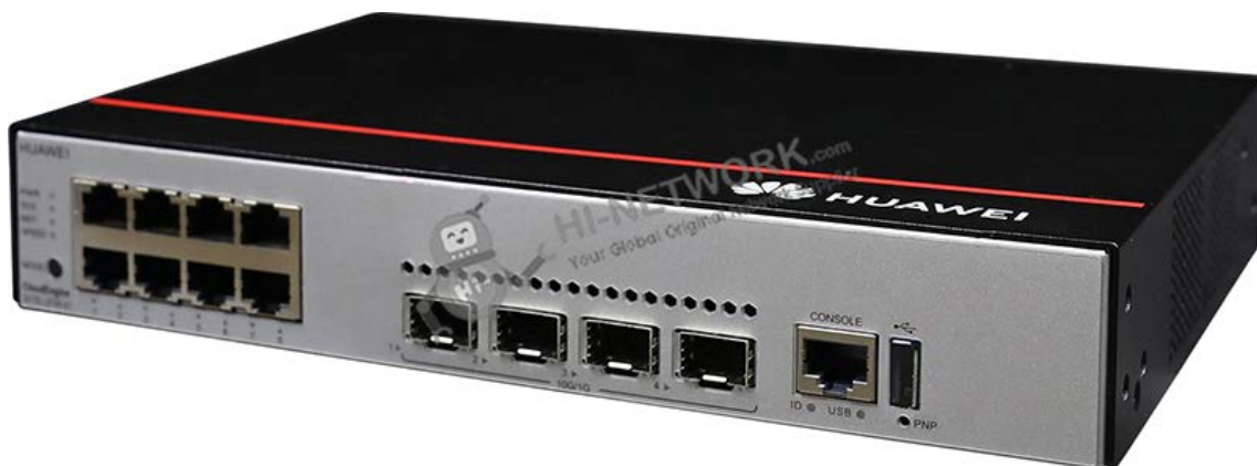
Figure 1 shows the appearance of S5735-L8T4X-A1.