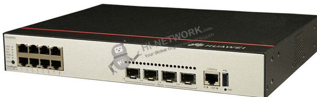
Figure 1 shows the appearance of S5735-L8P4X-IA1.