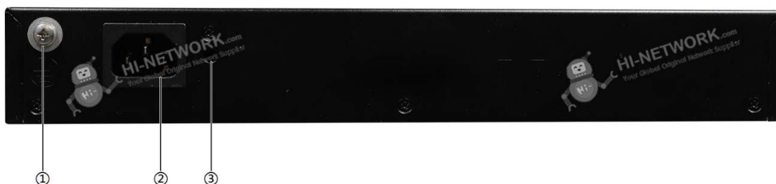
Figure 3 shows the back view of S5735S-L8P4S-A1.