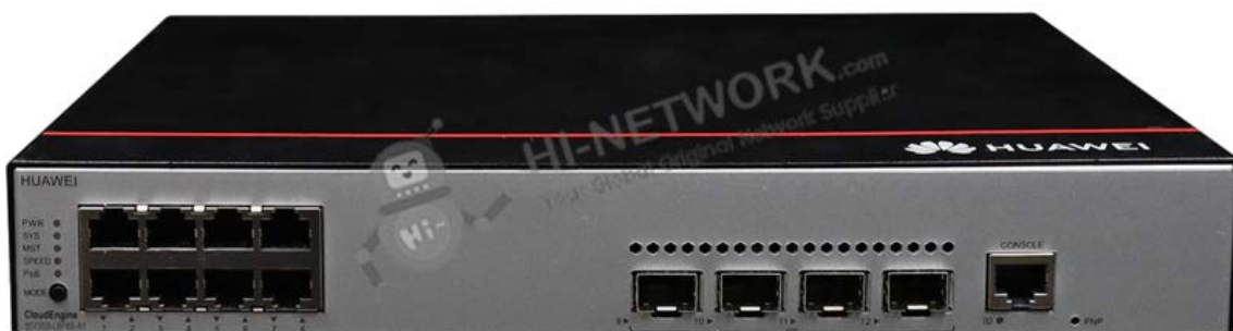
Figure 1 shows the appearance of S5735S-L8P4S-A1.