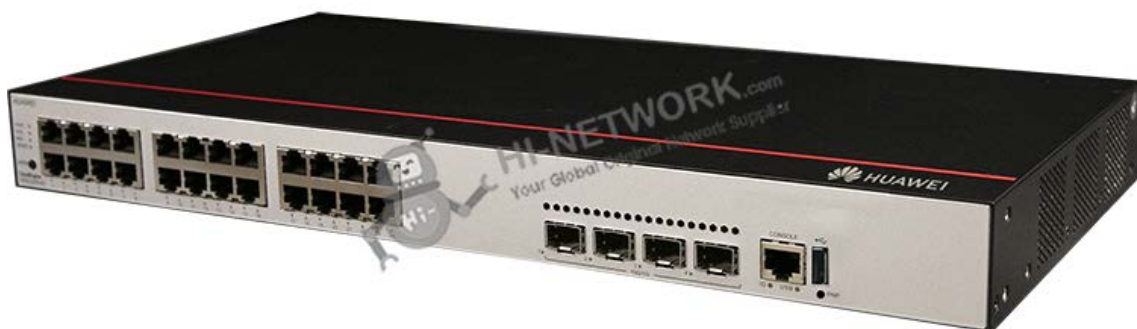
Figure 1 shows the appearance of S5735-L24T4X-IA1.