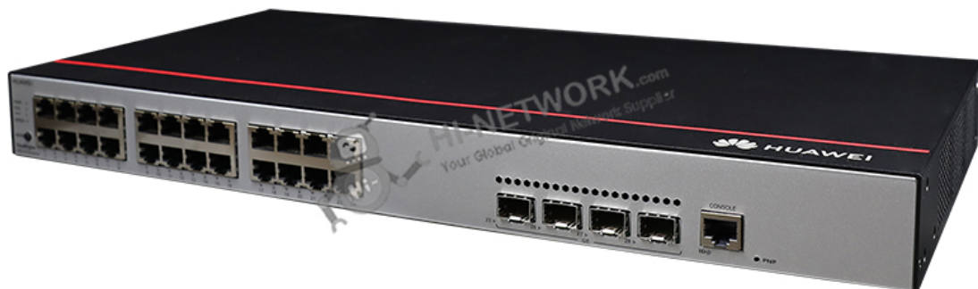
Figure 1 shows the appearance of S5735S-L24T4S-A1.