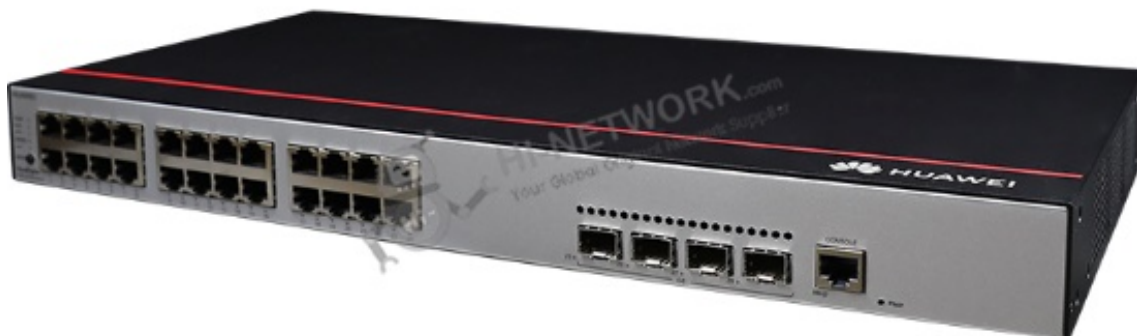
Figure 1 shows the appearance of S5735-L24P4S-A1.