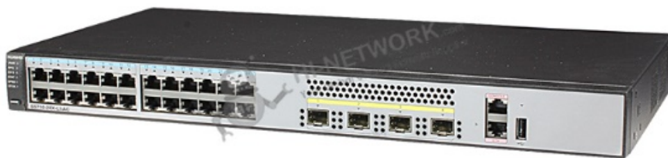
Figure 1 shows the appearance of S5710-28X-LI-AC.