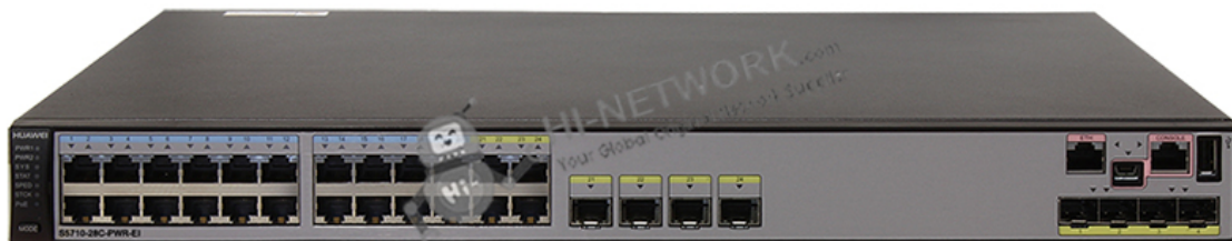
Figure 1 shows the appearance of S5710-28C-PWR-EI-AC.