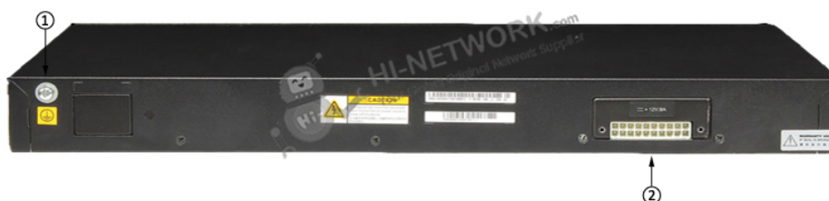
Figure 3 shows the back panel of S5701-28X-LI-24S-AC.

* The AC terminal locking latch is not delivered with the switch.