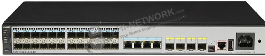
Figure 1 shows the appearance of S5701-28X-LI-24S-AC.