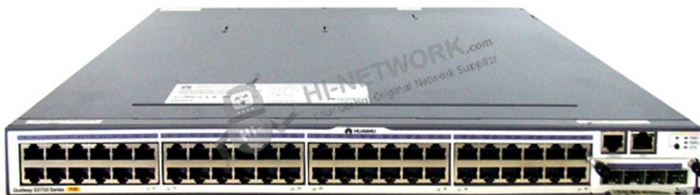
Figure 1 shows the appearance of S5700-52C-PWR-EI.