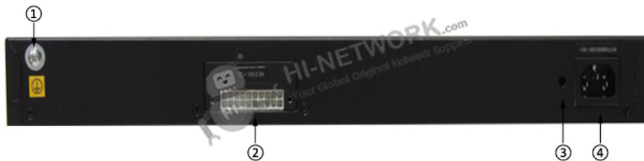
Figure 3 shows the back panel of S5700-28TP-PWR-LI-AC.