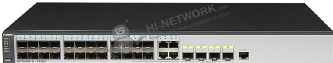
Figure 1 shows the appearance of S5700-28P-LI-24S-BAT.