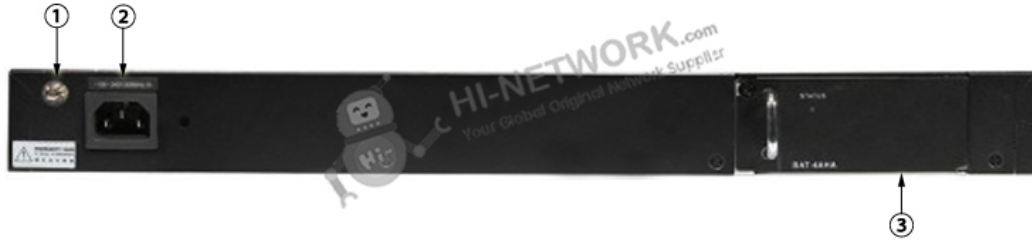
Figure 2 shows the front panel of S5700-28P-LI-24S-BAT.