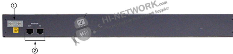
Figure 3 shows the back panel of S5700-28C-HI-24S.