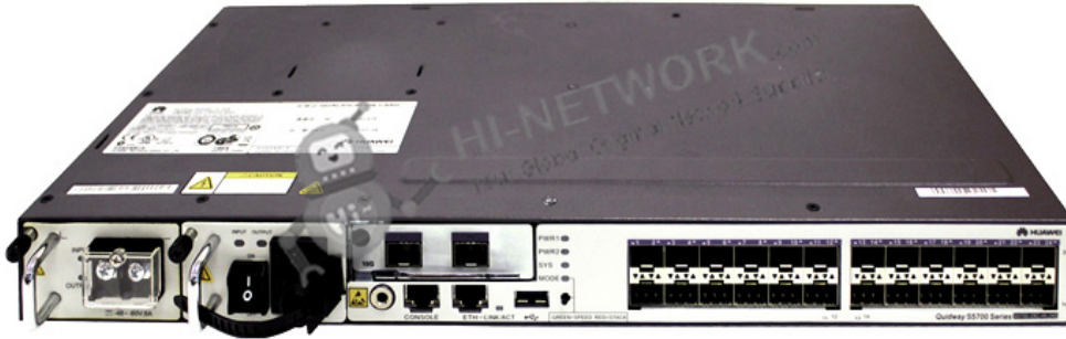
Figure 1 shows the appearance of S5700-28C-HI-24S.