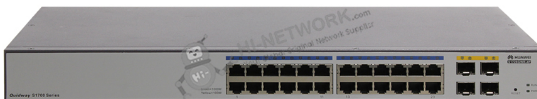
Figure 1 shows the appearance of S1728GWR-4P.