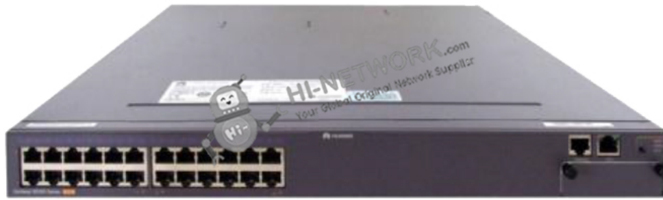
Figure 1 shows the appearance of LS-S5328C-PWR-EI.