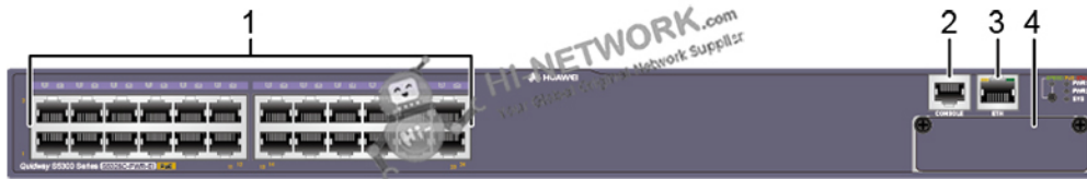
Figure 2 shows the front panel of LS-S5328C-PWR-EI.