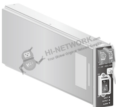
Figure 1 shows the appearance of ES02PSD16.