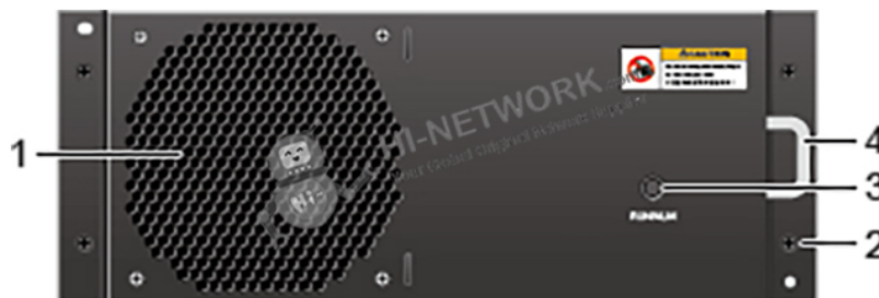
Figure 2 show the panel of EH1M00FBX000.