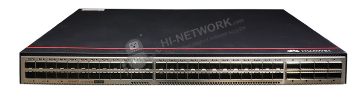
Figure 1 shows the appearance of CE6865E-48S8CQ-B.