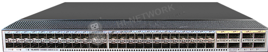
Figure 1 shows the appearance of CE6865-48S8CQ-EI.