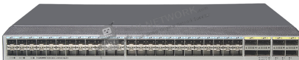
Figure 1 shows the appearance of CE6860-48S8CQ-EI.