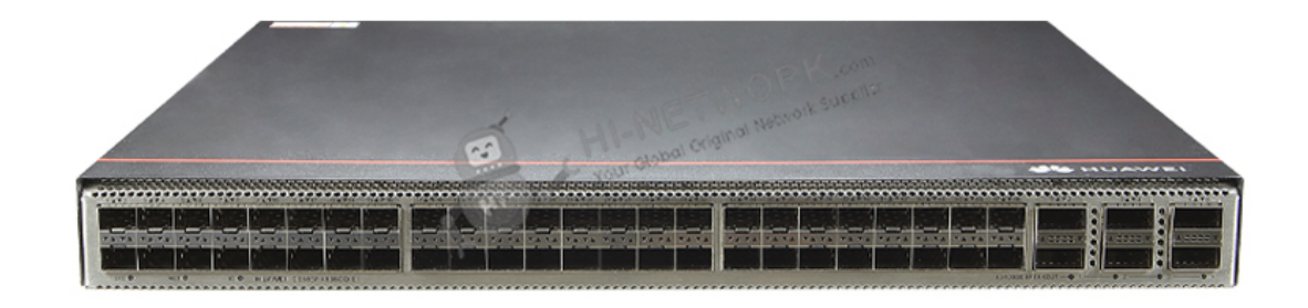
Figure 1 shows the appearance of CE6857-EI-B-B0B.