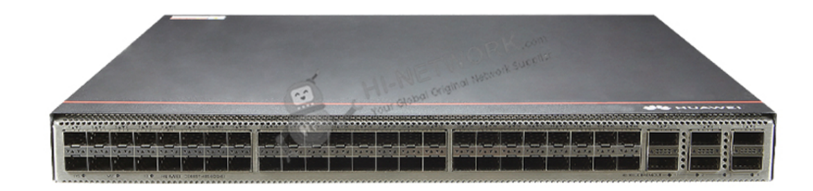
Figure 1 shows the appearance of CE6857-48S6CQ-EI.