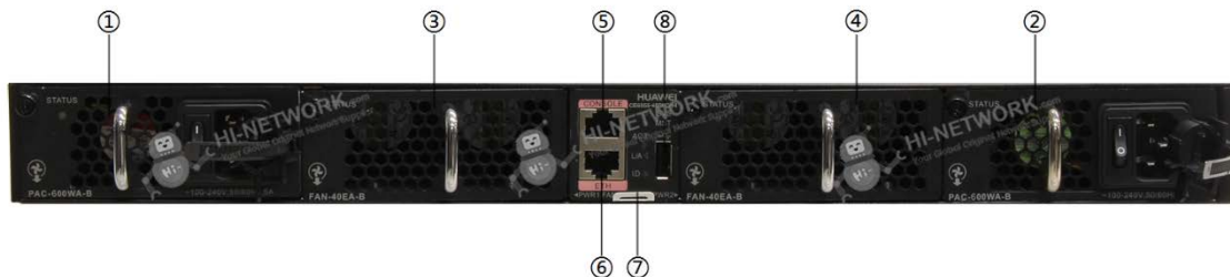
Figure 3 shows the rear (power supply side) panel of CE6856-48S6Q-HI.