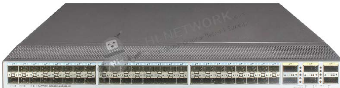
Figure 1 shows the appearance of CE6855-HI-B-B0A.