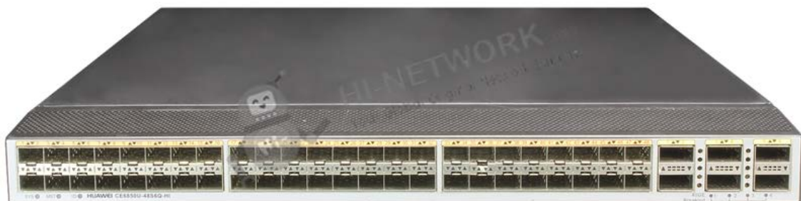
Figure 1 shows the appearance of CE6850U-48S6Q-HI.