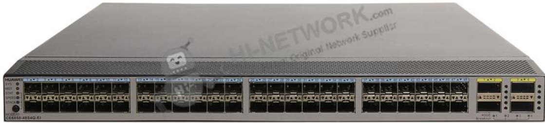
Figure 1 shows the appearance of CE6850-EI-B00A.