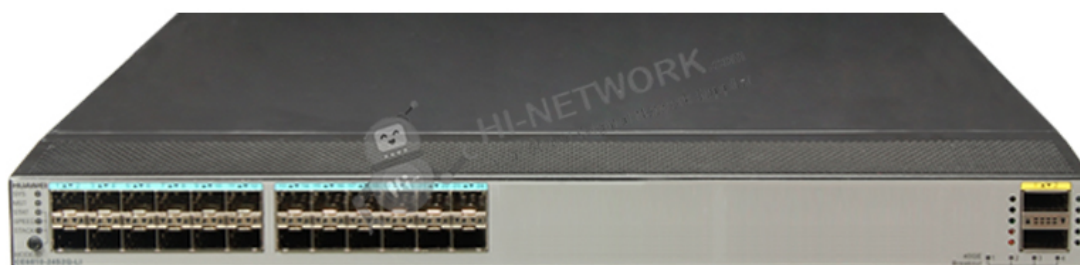
Figure 1 shows the appearance of CE6810-24S2Q-LI-B.