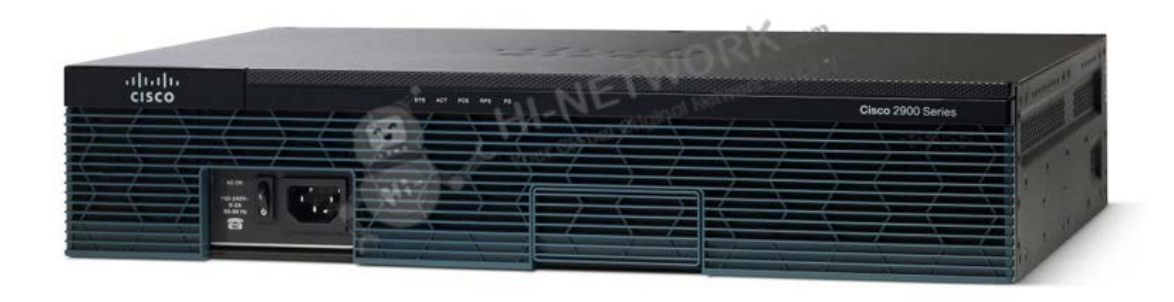
Figure 1 shows the front view of CISCO2911-SEC/K9.