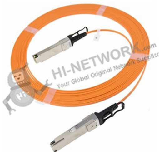
Figure 1 shows the appearance of QSFP-H40G-AOC5M.