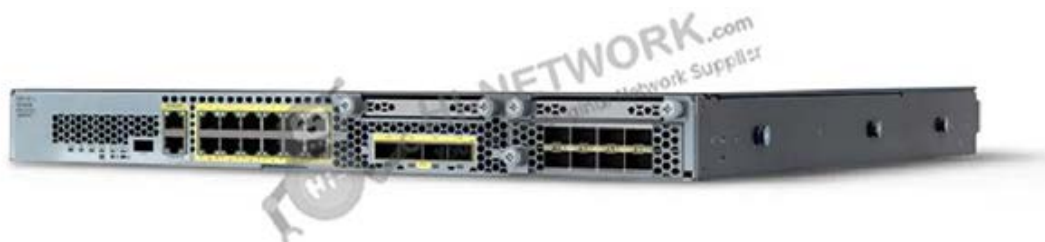
Figure 1 shows the appearance of FPR2140-NGFW-K9.