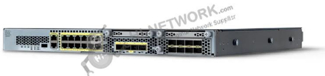
Figure 1 shows the appearance of FPR2130-NGFW-K9.