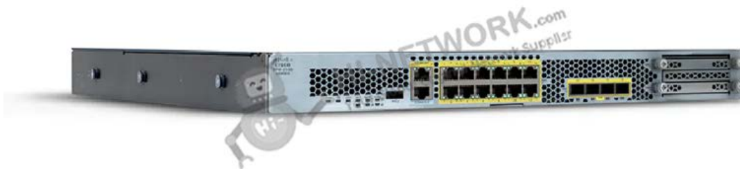
Figure 1 shows the appearance of FPR2120-ASA-K9.