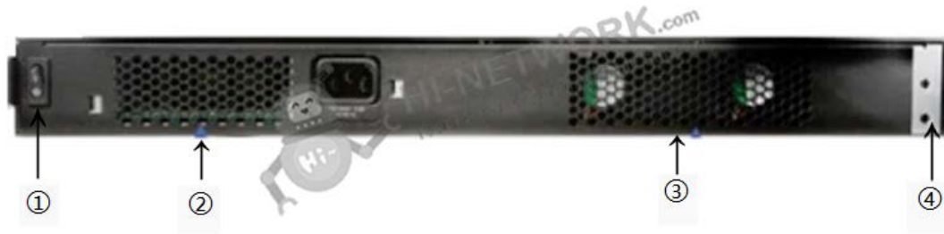
Figure 3 shows the rear panel of FPR2120-ASA-K9.