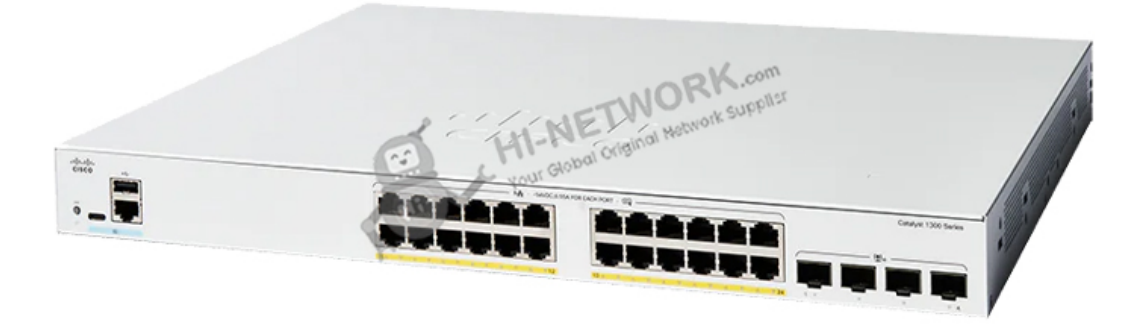
Figure 1 shows the appearance of C1300-24FP-4X.