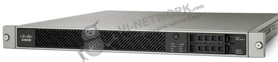
Figure 1 shows the front panel of ASA5545-FPWR-K9.