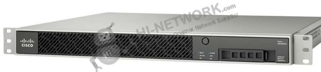
Figure 1 shows the appearance of ASA5515- K9.