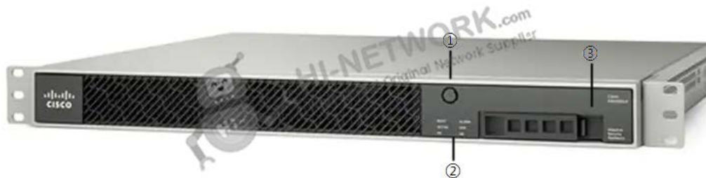
Figure 2 shows the front panel of ASA5515- K9.