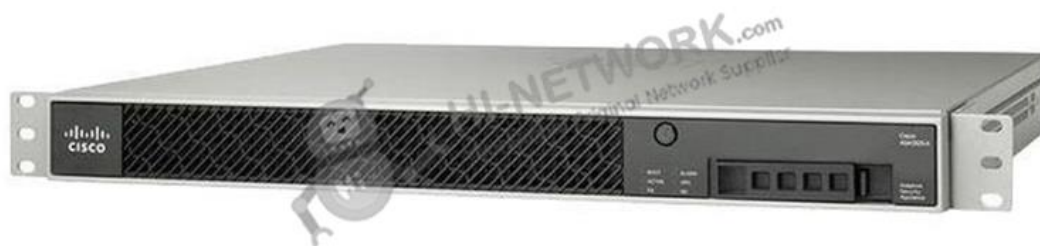
Table 1 shows the Quick Specs of the ASA5512-IPS-K9.