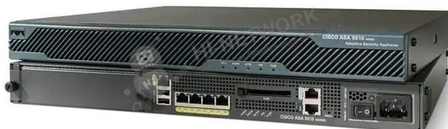
Figure 1 shows the appearance of ASA5510-SEC-BUN-K9.