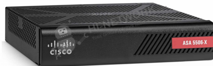
Figure 1 shows the appearance of ASA5506-K9.