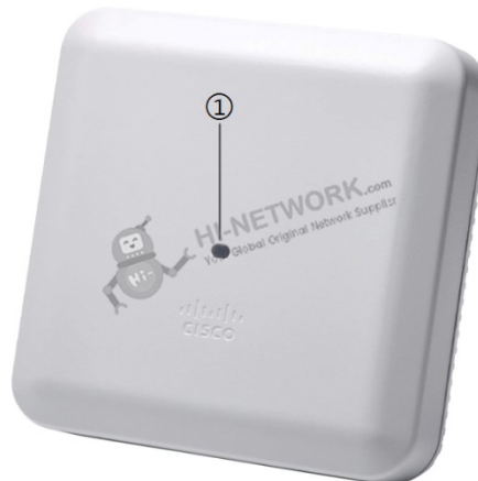
Figure 2 shows the face of AIR-AP2802I Model.