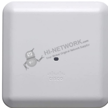
Figure 1 shows the appearance of the AIR-AP2802I-E-K9.