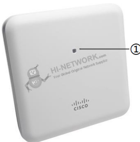
Figure 2 shows the AIR-AP1852I LED Indicator Position.