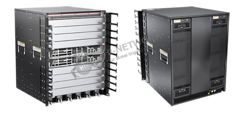
Figure 1 shows the appearance of S8700-10.