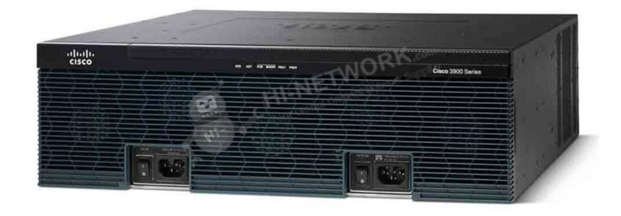
Figure 1 shows the appearance of the C3945E-VSEC/K9.