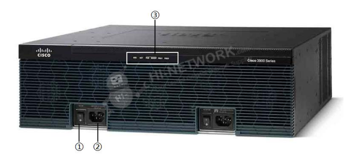
Figure 2 shows the front panel of the C3945E-VSEC/K9.